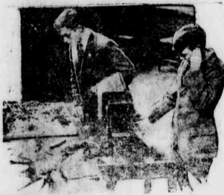
English fans are using the radio to help them in their school studies. Broadcasting stations have been sending out valuable information in connection with the various schoolroom lectures, and the boys are taking advantage of this help in solving their more difficult problems. Here are two enthusiasts learning facts about the sea and its life, by radio.