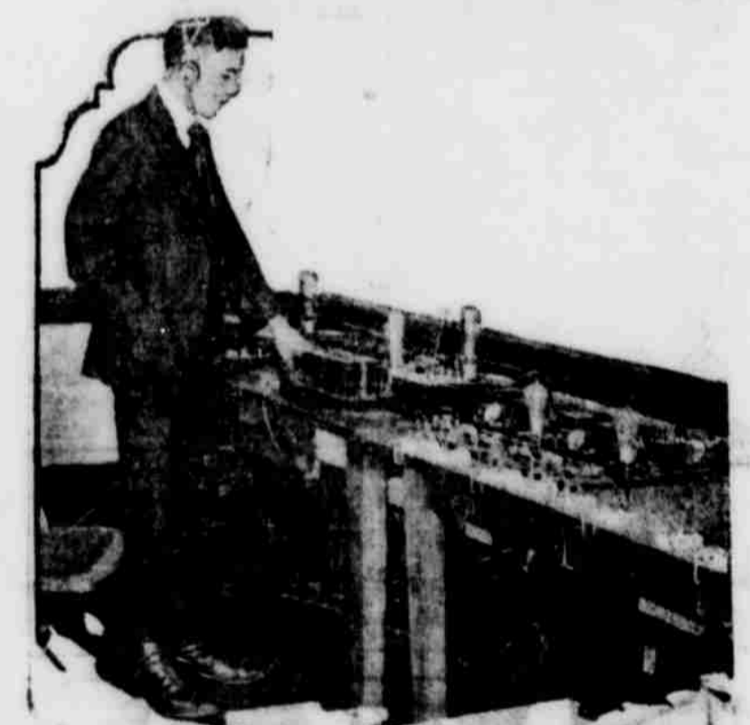
Radio has its censors. But they're not of the movie variety. They're rather a help than a hindrance to the radio fan. Instead of saying what shall or shall not go by radio, this censor sees that what is broadcast goes out clear and strong enough for easy reception by the radio amateur. He listens in radio concerts and lectures and amplifies the sound and volume for broadcasting.