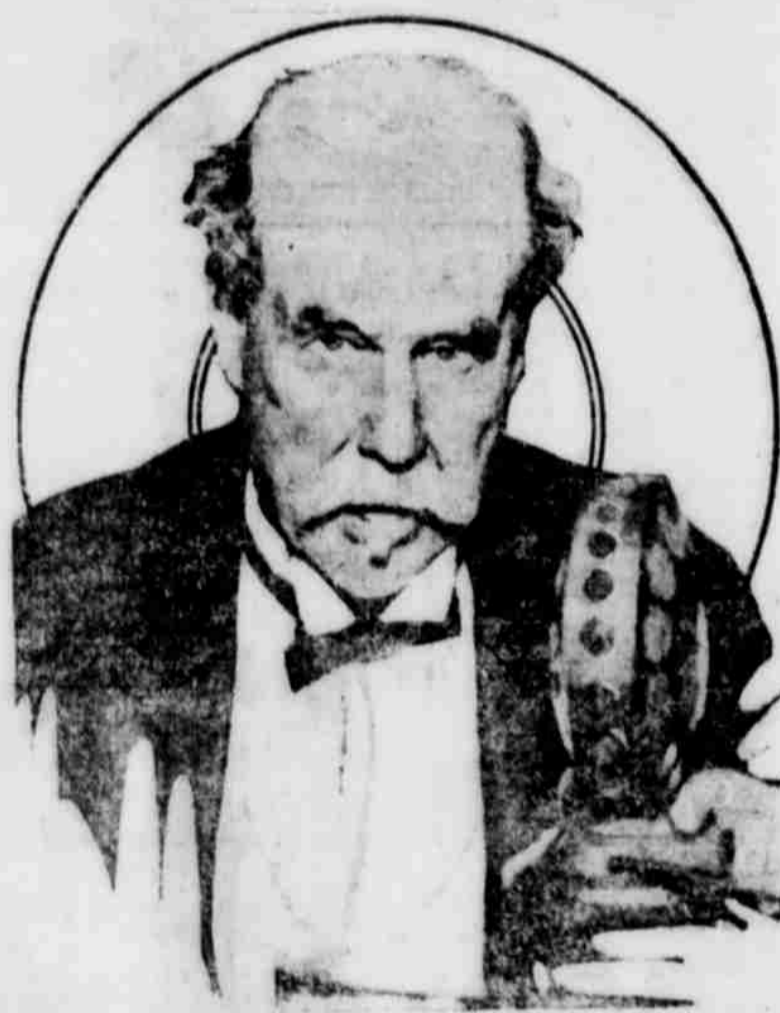
S. J. Thomas Lipton, famous Scot sportsman, has the honor of being the first man to send his voice across the Atlantic by radio. From station WGR of the L. Bamberger & Co. store at Newark, N. J., his message was heard at Selfridge's department store in London. All Sir Thomas did to accomplish this historic feat was to talk into the small instrument shown. Radio did the rest.