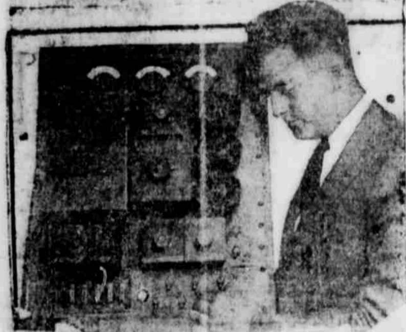
It is no longer necessary to put an "more stress on talk" to be broadcast by radio. A new speed input amplifier device, shown above, makes sure of that. This apparatus amplifies the voice before it enters the transmitting apparatus. Not only is it easy to send the voice broadcast, but the transmitting operator is enabled to hear the voice directly, so that he may supervise the broadcasting.