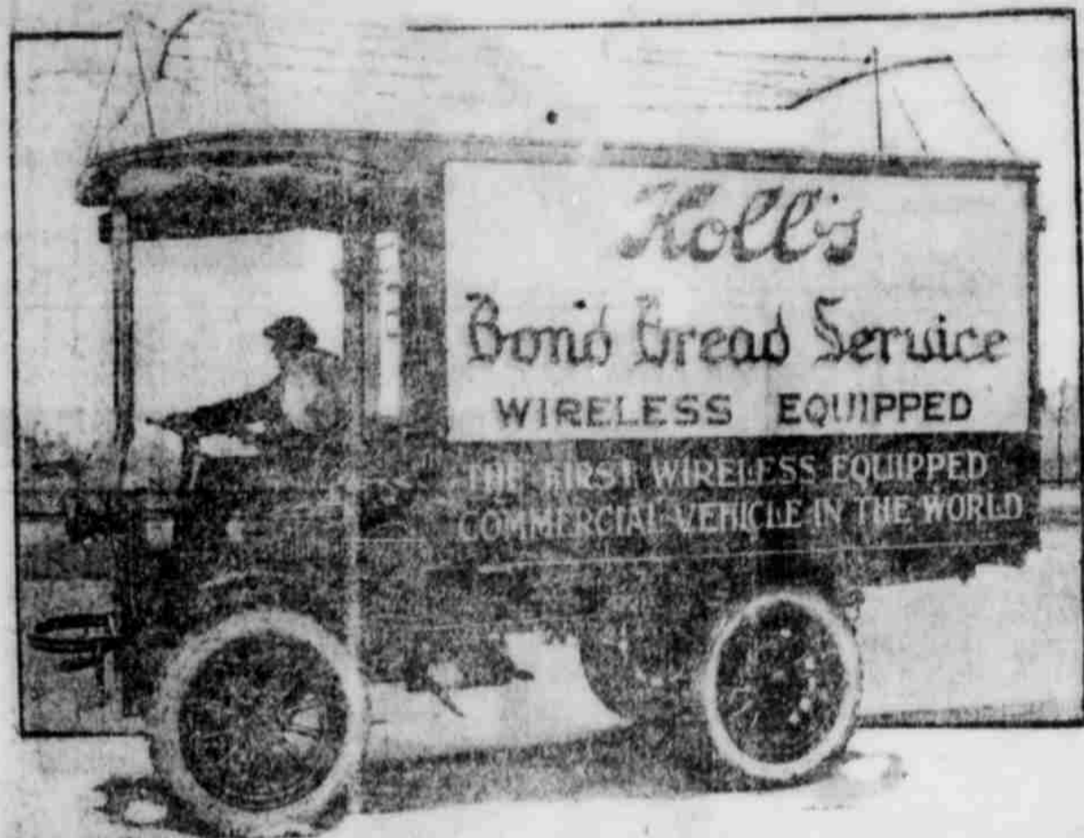
Housewives in Philadelphia have a chance to order their bread by radio. That is, if they have a radio transmission set at home and they deal with the particular firm that has equipped the wagons with a radio receiving set. As any one who knows what possibilities radio presents for the housewives of the future.