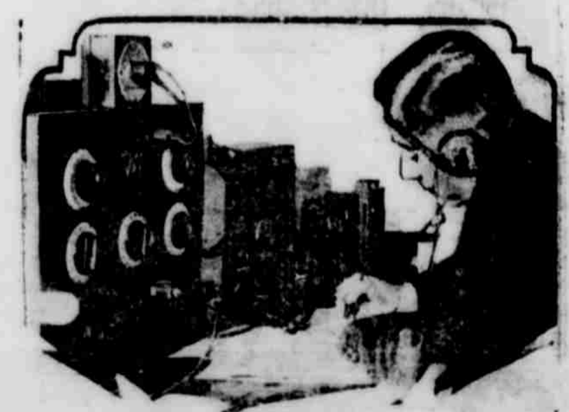
All reports of the world's weather forecasters come to official Germany by radio. This is part of the receiving equipment of the huge Berlin station which receives reports from London, Paris and other important centers. Later, from the transmitting end of the same station, a summary of these reports are broadcast to radio fans in Germany.